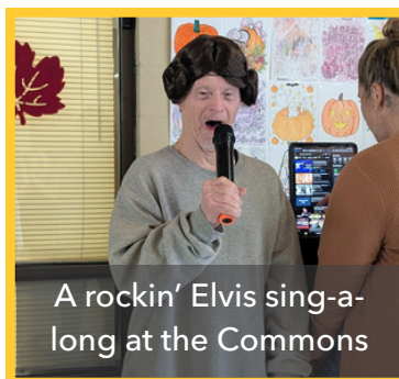
A rockin' Elvis sing-a-long at the Commons