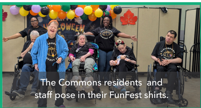
The Commons residents and staff pose in their FunFest shirts.