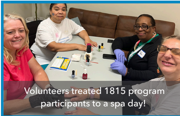
Volunteers treated 1815 program participants to a spa day!