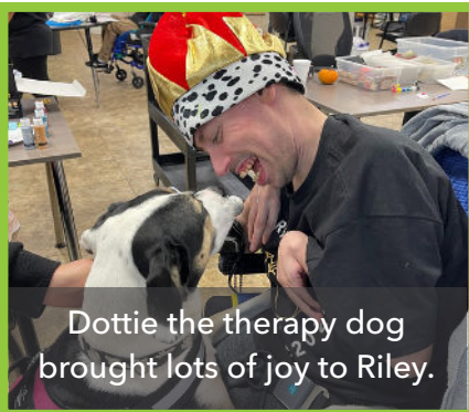
Dottie the therapy dog brought lots of joy to Riley.