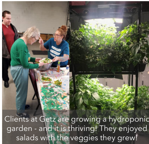
Clients at Getz are growing a hydroponic garden - and it is thriving! They enjoyed salads with the veggies they grew!