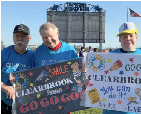
It was a beautiful weekend for Special Olympics! Volunteers, families, and staff came out to cheer them on!