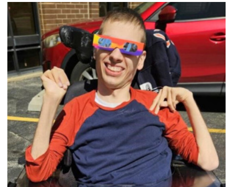
Clients at Getz had fun watching the solar eclipse