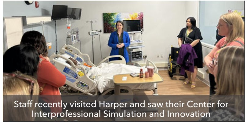
Staff recently visited Harper and saw their Center for Interprofessional Simulation and Innovation