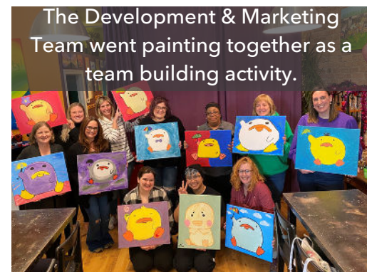
The Development & Marketing Team went painting together as a team building activity.