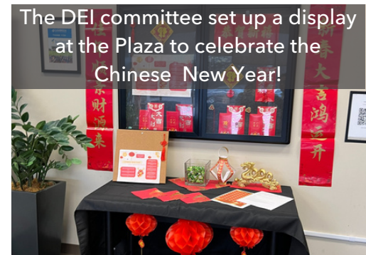
The DEI committee set up a display at the Plaza to celebrate the Chinese New Year!