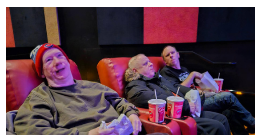
Gentleman from the Strathmore CILA had fun at the movies!