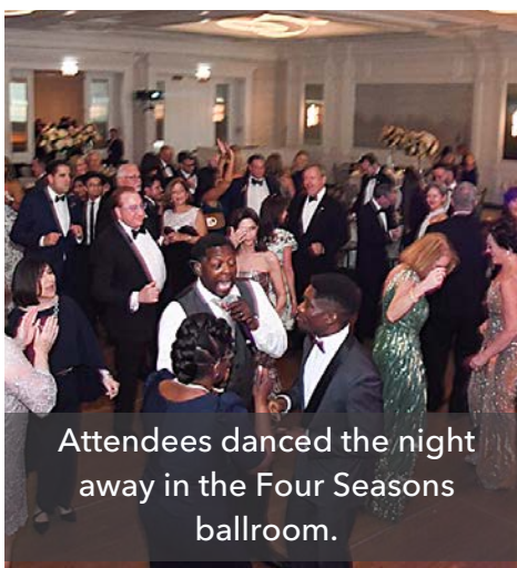
Attendees danced the night away in the Four Seasons ballroom.