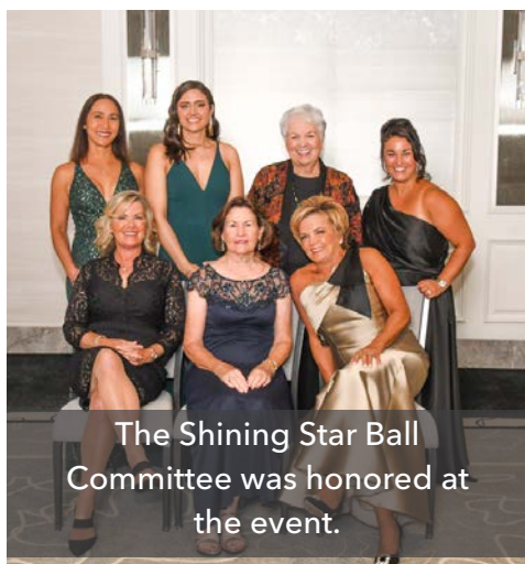
The Shining Star Ball Committee was honored at the event.

We hope you will join us at the Four Seasons on Friday, May 17, 2024 for the next Shining Star Ball. Mark your calendar!