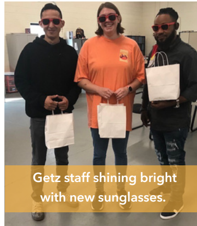
Getz staff shining bright with new sunglasses.