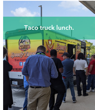
Taco truck lunch.