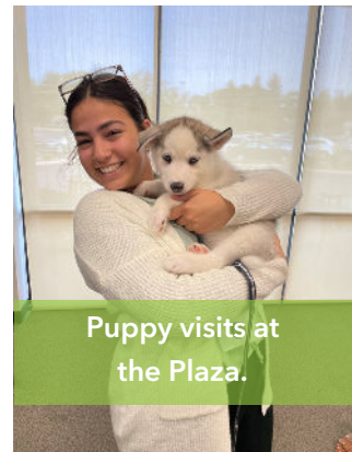
Puppy visits at the Plaza.