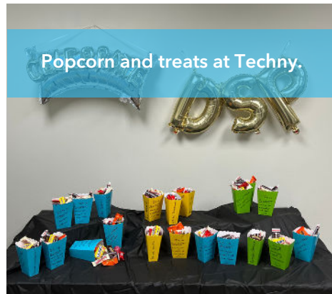
Popcorn and treats at Techny.