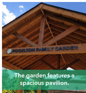
The garden features a spacious pavilion.