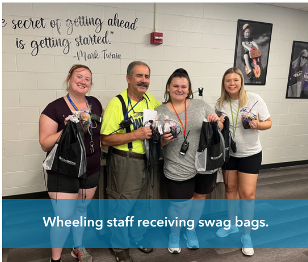
Wheeling staff receiving swag bags.

Management was excited to show their staff just how much their hard work is appreciated.