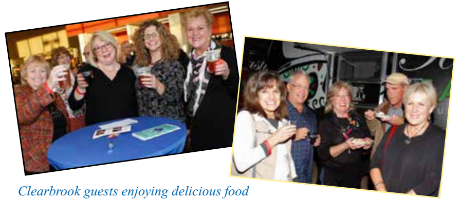
Clearbrook guests enjoying delicious food samples from Toasty Taco's food truck. Don't miss this tasty event!

Are you a foodie and looking to try something new and fun? Come support Clearbrook's 10 th Annual Around the World Food Tasting event on Tuesday, October 16, at Arlington Toyota-Scion from 5:30-8:00pm. This event is a food festival like no other, featuring twenty different cuisines from local neighborhood restaurants.