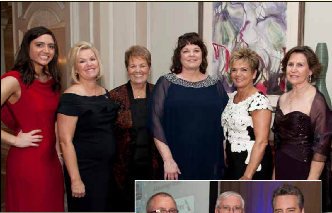
Members of the Shining Star Ball committee who work tirelessly each year to make the Ball a spectacular event.