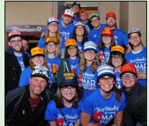
More than 200 Clearbrook supporters came out to support the 10 th Annual Pub Crawl event wearing their best hat!

Tip your hat and raise your glass to the 2018 Mad Hatter Mayhem Pub Crawl. Over 200 Clearbrook supporters threw on their craziest hats and took to the streets of Wicker Park in Chicago on Saturday, April 14 to attend the Associate Board's 10th annual Mad Hatter Mayhem Pub Crawl. This year's bar crawl started at The Den Theatre, and included stops at Bangers & Lace, The Anthem and Emporium Arcade Bar.